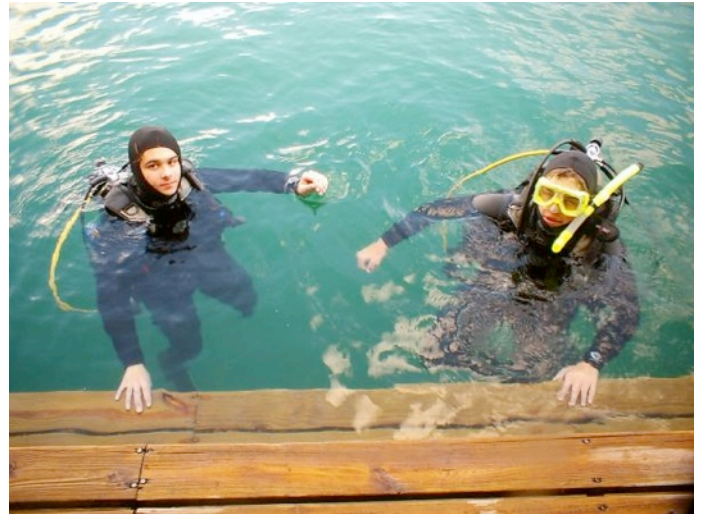
Day 4 dives at Haigh Quarry

Looking for an opportunity to help out the S.T.A.R.S. program and enjoy a lifetime of memories? Visit www.outoftheshoebbox.com for a special offer (valid until 9/30/07) and move those pictures out of the shoe box and into living color. A percentage of the proceeds from the special offer will be donated to stars. Click on the hammerhead (compliments of Brandon T.) for more details